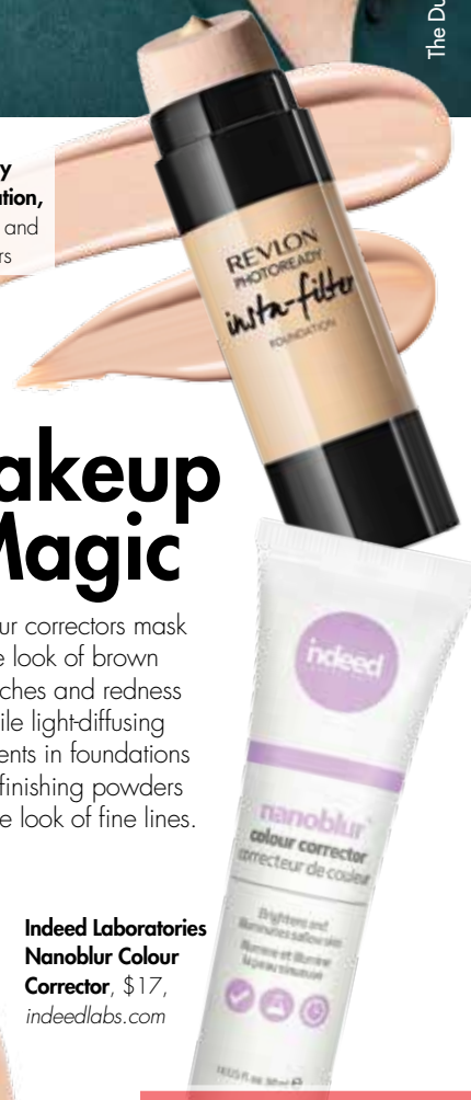
Indeed Laboratories Nanoblur Colour Corrector, $17, indeedlabs.com

Colour correctors mask the look of brown splotches and redness while light-diffusing pigments in foundations and finishing powders blur the look of fine lines.