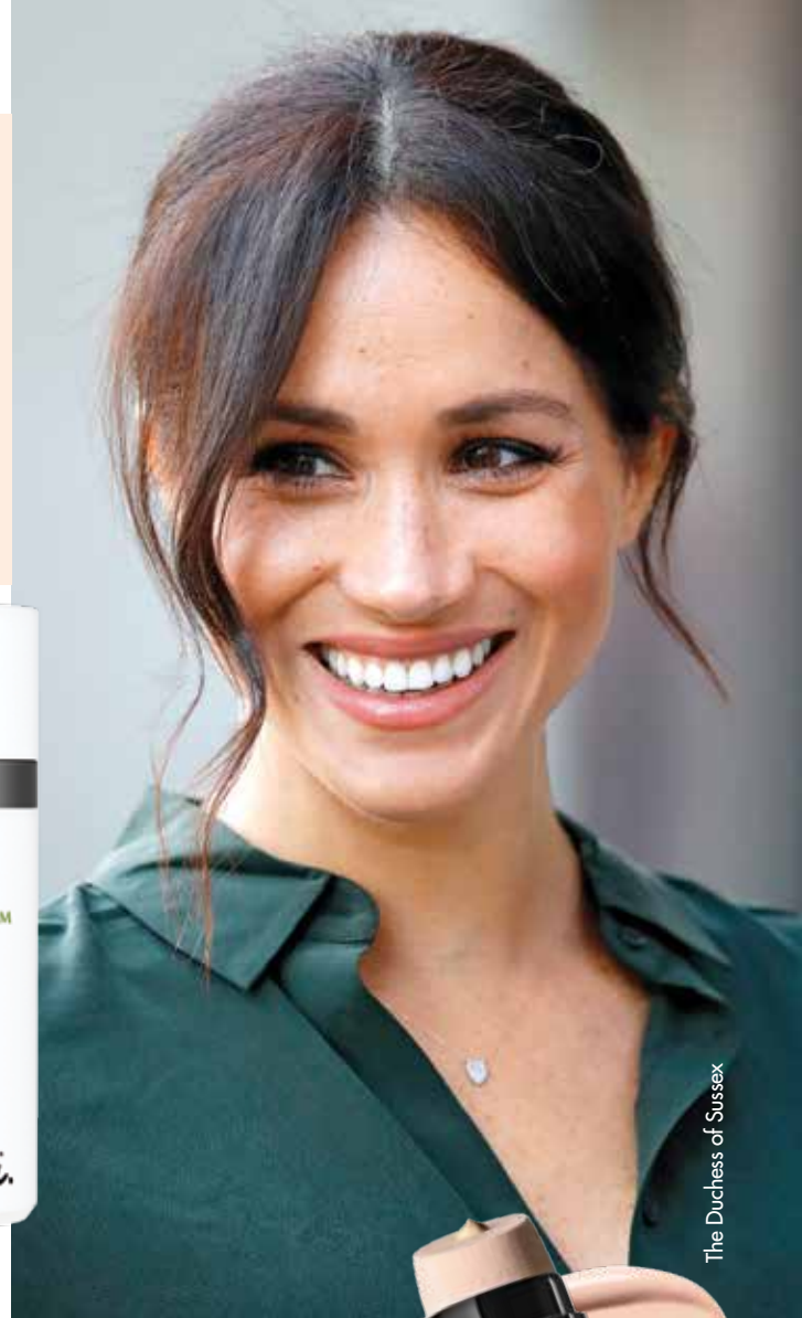
The Duchess of Sussex