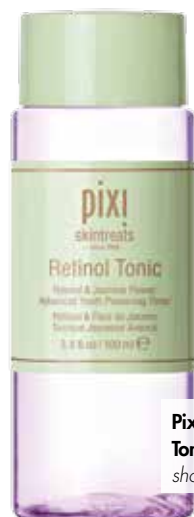
Pixi Beauty Retinol Tonic , $20, shoppersdrugmart.ca