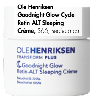
Ole Henriksen Goodnight Glow Cycle Retin-ALT Sleeping Crème , $66, sephora.ca