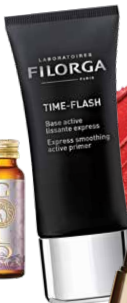
Filorga Time-Flash Express Smoothing Active Primer, $65, shoppersdrugmart.ca

Look for primers that form a tightening film over your skin's surface to provide temporary lift, and sculpting lipsticks that create the illusion of full lips.