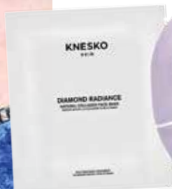
Knesko Skin Diamond Radiance Natural Collagen Face Mask Single, $60, holtrenfrew.com