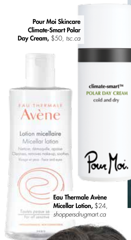
Pour Moi Skincare Climate-Smart Polar Day Cream, $50, tsc.ca