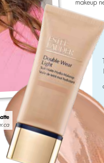
Estée Lauder Double Wear Light Soft Matte Hydra Makeup SPF 10 , $50, esteelauder.ca