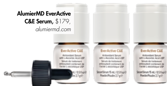
AlumierMD EverActive C&E Serum, $179, alumiermd.com