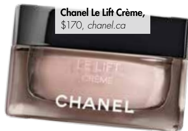
Chanel Le Lift Crème, $170, chanel.ca

therapy) uses fine needles to create tiny punctures in your skin, tricking it into repair mode. H