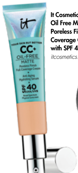
It Cosmetics CC + Oil Free Matte Poreless Finish Full Coverage Cream with SPF 40, $49, itcosmetics.ca

An oilfree, tinted CC cream with high SPF provides UV protection without having to layer skin care, which can lead to clogged pores. Eyeshadow primers and gel-formula colours ensure eyeshadows stay put over greasy eyelids.