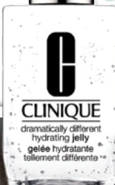
Clinique Dramatically Different Hydrating Jelly, $36, clinique.ca