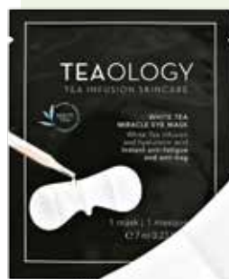
Teaology White Tea Miracle Eye Mask , $5 teaologyskincare.ca

TIP: You can pop these eye masks into the fridge as an alternative.