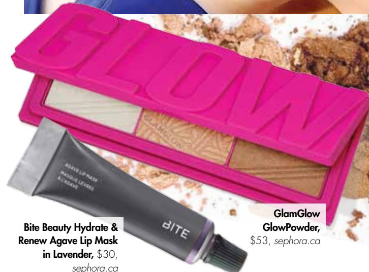
Bite Beauty Hydrate & Renew Agave Lip Mask in Lavender , $30, sephora.ca

Oils like jojoba and sweet almond add an extra layer of comfort to a dehydrated pout. Plus, soft-focus foundations and highlighters enriched with hyaluronic acid ensure your makeup never looks cakey.