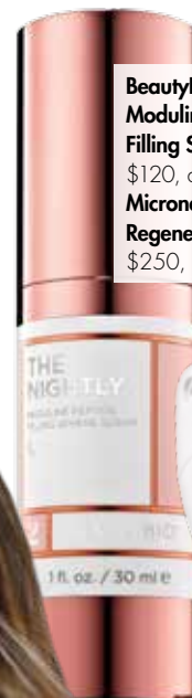
BeautyBio The Nightly Moduline Peptide Filling Sphere Serum, $120, and GloPro Microneedling Regeneration Tool, $250, holtrenfrew.com