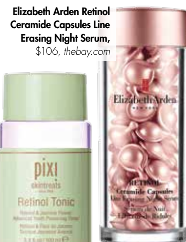
Elizabeth Arden Retinol Ceramide Capsules Line Erasing Night Serum , $106, thebay.com