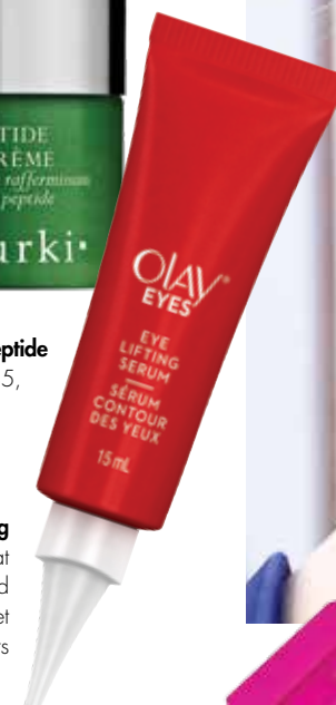
Olay Eyes Lifting Serum , $34, at drugstores and mass-market retailers