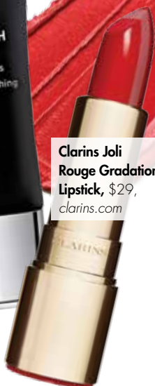
Clarins Joli Rouge Gradation Lipstick, $29, clarins.com