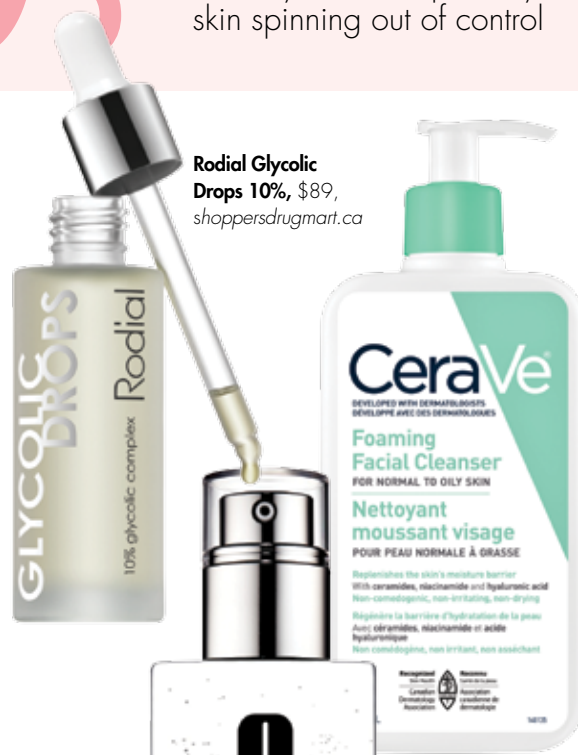
Rodial Glycolic Drops 10%, $89, shoppersdrugmart.ca

A bit of breakout is normal, but many women break out because they're using the wrong products for their skin such as creams that contain oil, says Dr. Rhonda Rand, long-time dermatologist to Angelina Jolie. The solution: edit down your skin-care routine to the essentials and avoid your mother's too-rich anti-aging cream. "Moisturizer doesn't prevent wrinkles, it treats dryness," she explains, adding that you can apply oil-free lotions to parched areas if you have combination skin. Otherwise, stick to a multi-tasking SPF to protect against aging UV rays. Glycolic acid is effective at sloughing away dead skin cells to aid with acne, and can also be applied selectively to areas that need it.