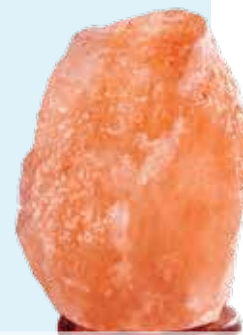
Himalayan Crystal Salt Lamp , $35, earth-luxe.ca

TIP: Keep a salt lamp by your desk to reap its benefits daily.