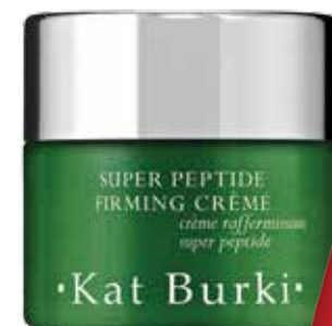
Kat Burki Advanced Anti-Aging Super Peptide Firming Crème , $285, beautyboutique.ca