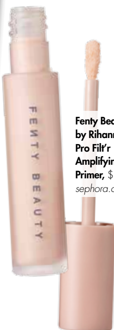
Fenty Beauty by Rihanna Pro Fil'r Amplifying Eye Primer, $28, sephora.ca